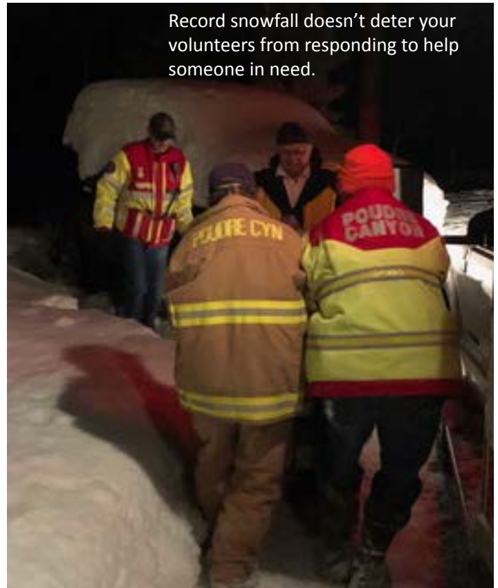
Record snowfall doesn't deter your volunteers from responding to help someone in need.