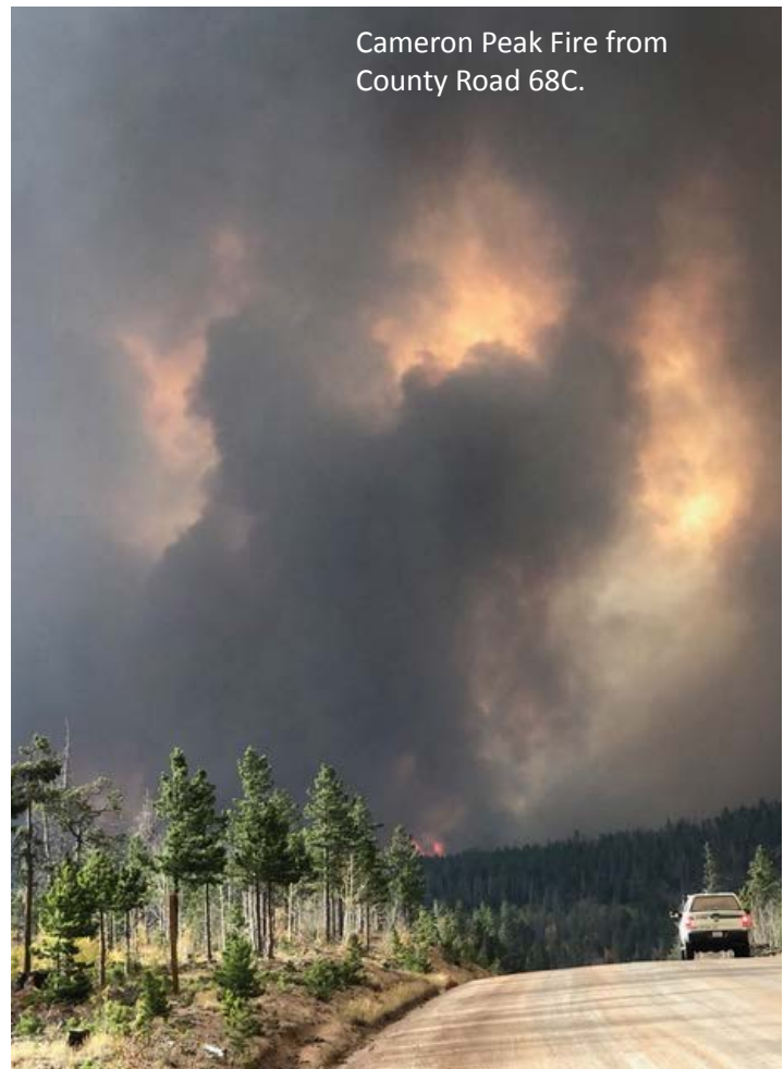
Cameron Peak Fire from County Road 68C.